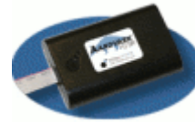
Aardvark I2C/SPI Host Adapter