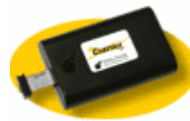
Cheetah SPI Host Adapter