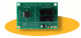
High-Speed SPI Flash Demo Board

Software and firmware upgrades are always freely available in www.totalphase.com