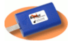
Beagle I2C/SPI Protocol Analyzer